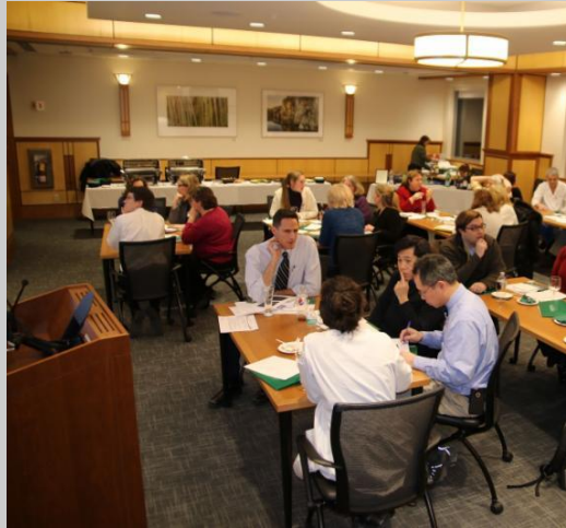
Interdisciplinary Planning for TDTs in 2016