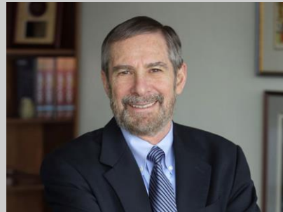
Douglas Lowy, MD

Acting director of the National Cancer Institute (NCI), Douglas R. Lowy, MD, will be presenting a J. Walter Juckett Distinguished Lecture on Monday, February 6, 2017 from 12 to 1 PM in Davis Auditorium. Lowy will be at UVM to speak about his decades-long research on the papillomavirus. To learn more about Dr. Lowy or his research, click here .