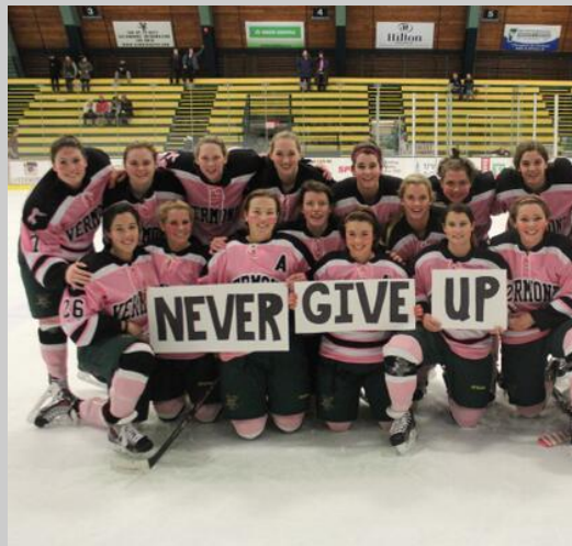
UVM Women's Hockey Rallying Against Cancer