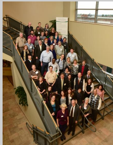
UVM Cancer Center members at the Fall 2015 retreat

Attendees are encouraged to provide feedback via the survey, as well to send feedback on grants and publications directly to Kate Webster .