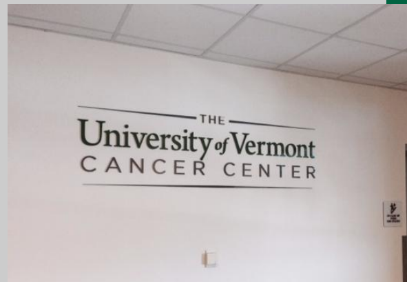
New Signage for the Cancer Center on the Third Floor of the HSRF