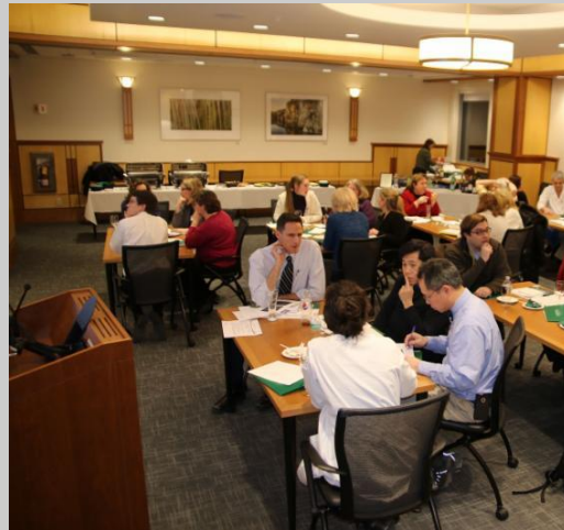
Interdisciplinary Planning for TDTs in 2016

The UVM Cancer Center will send agendas to members, if available, one week ahead of scheduled meetings to facilitate participation by members.