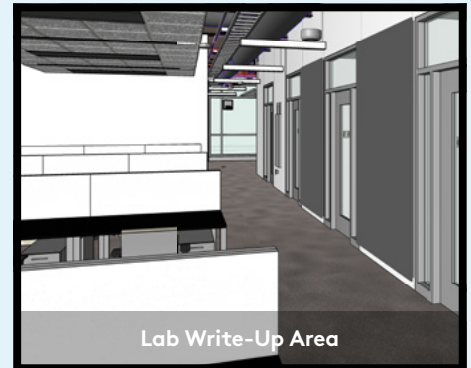
Lab Write-Up Area