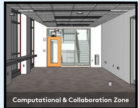
Computational & Collaboration Zone