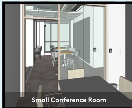
Small Conference Room