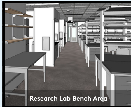
Research Lab Bench Area