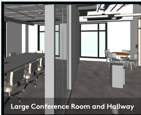
Large Conference Room and Hallway