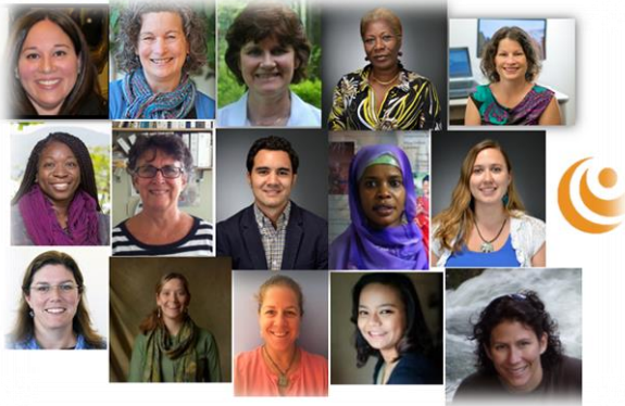
VT-LEND Interdisciplinary Faculty and Staff