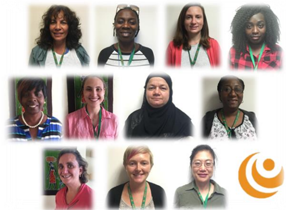
VT LEND Trainees and Fellows (T/Fs) 2016-17