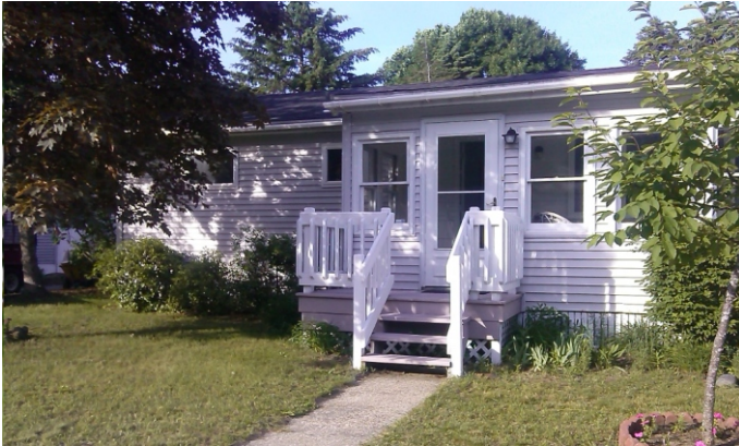
Front of house