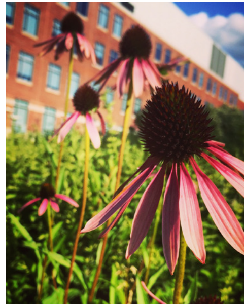
LCOM Creative Services

PARTICIPATION..... 21% TOTAL ..... $9,650 AGENT... Allyson Miller Bolduc