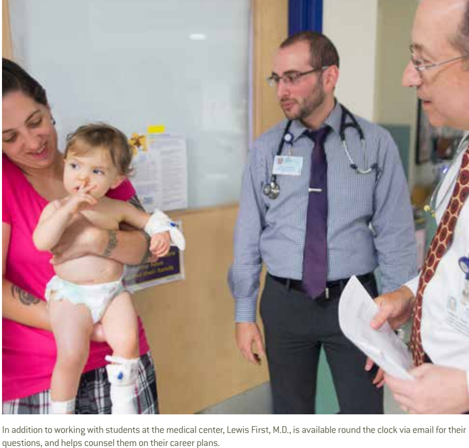
questions, and helps counsel them on their career plans.

"He does a monthly interactive session with students and residents where he plays parents on the telephone asking questions