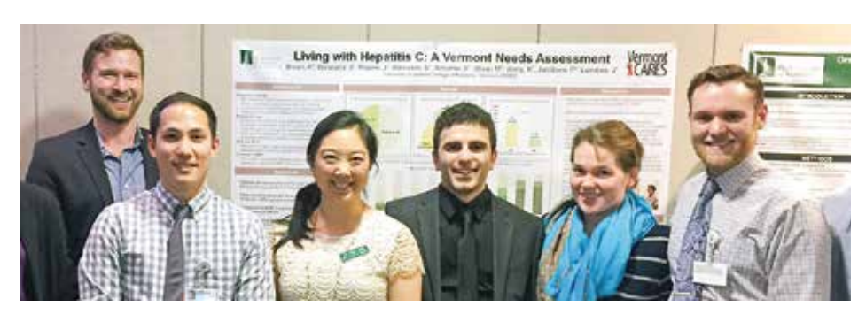
Members of the medical student public health project who worked with Vermont CARES to gain funding for a Hepatitis C case management project.