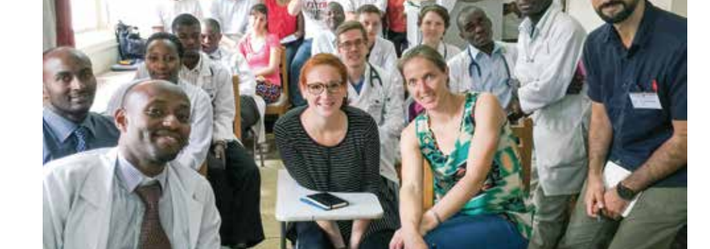
UVM medical students with staff members of the Mulago Hospital in Uganda in the summer of 2015.